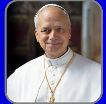
THE SUPREME PONTIFF POPE LEO XIV